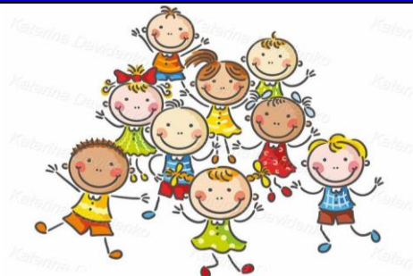
MUSIC ~ DANCE ~ ENERGY